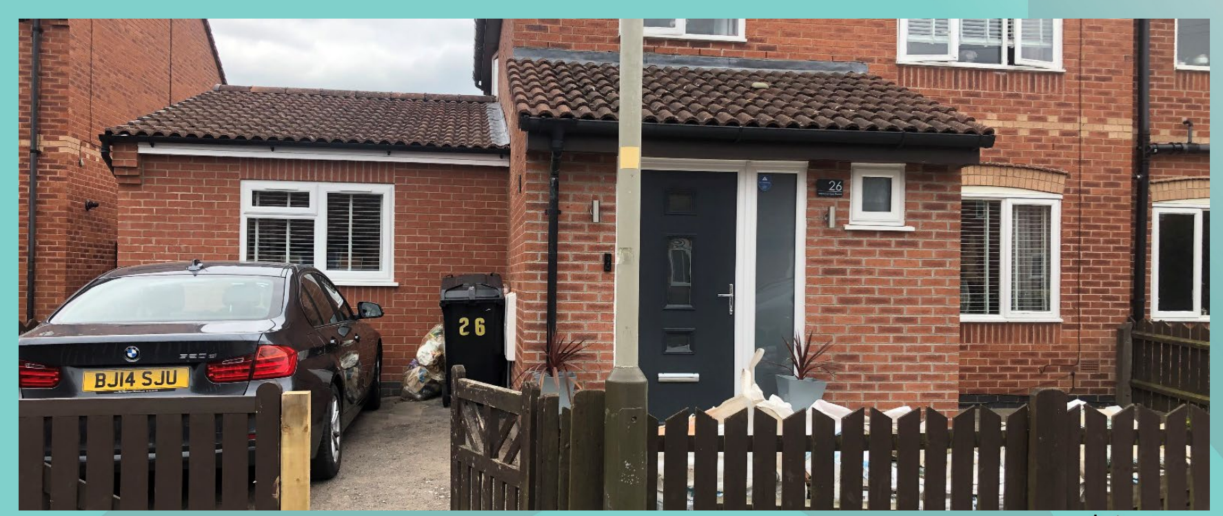
Leicester City Council