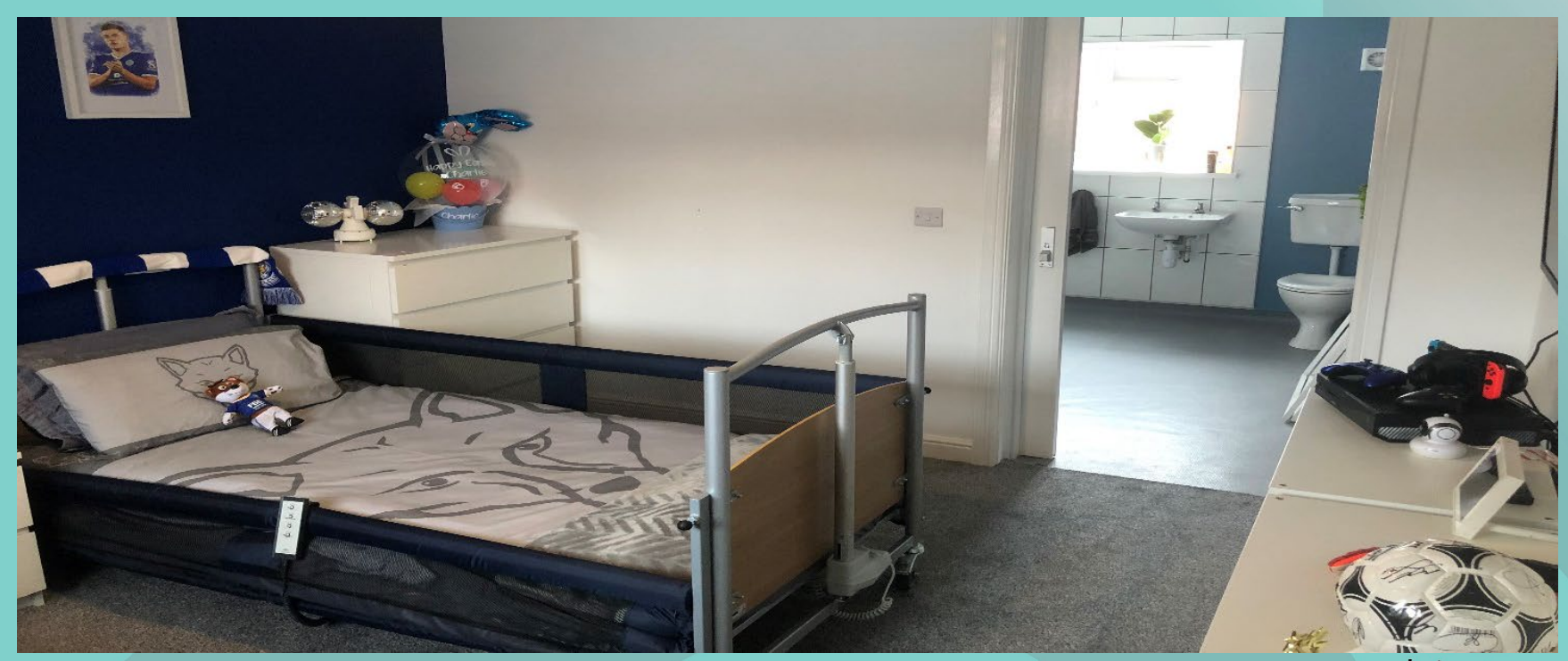
Leicester City Council